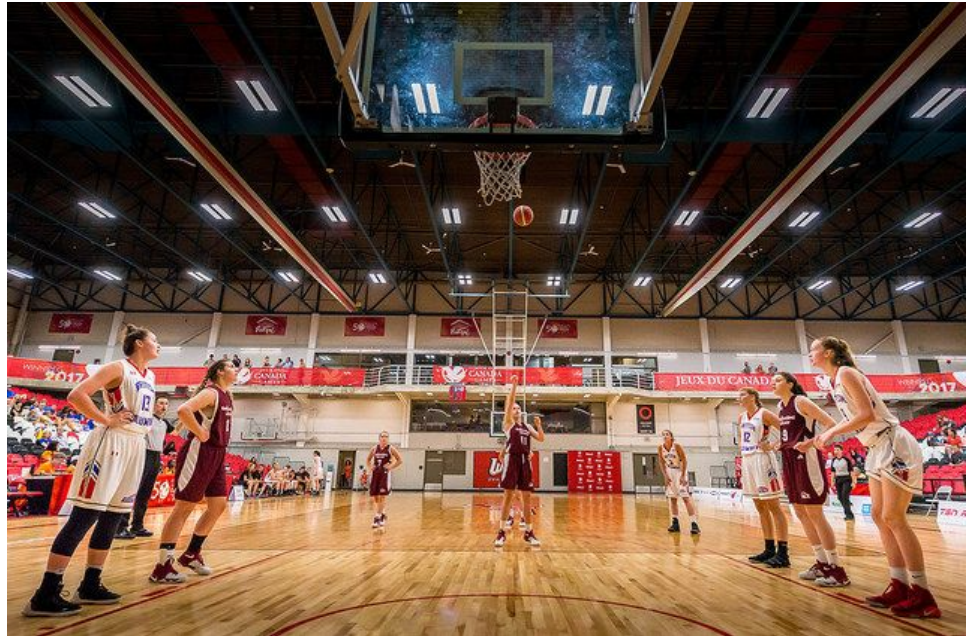
"At the line" Team NL vs British Columbia